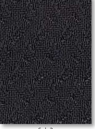
Solo2 HCU Gravel