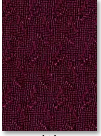
Solo2 HCV Currant