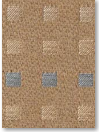
Intermix HWB Bisque