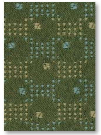
Verge FTF Living