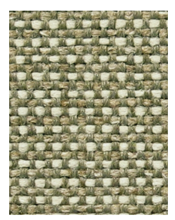
Shire FDA Sesame