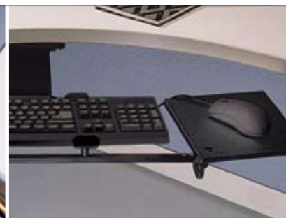
Ergonomic keyboard trays and mouse pads