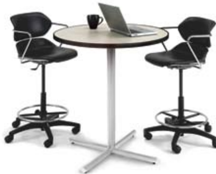
42" H Café table Credence X-Base