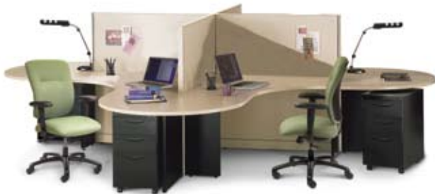
Framework Access® system