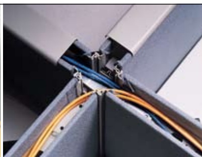
Top of the panel telecommunications cable pathway