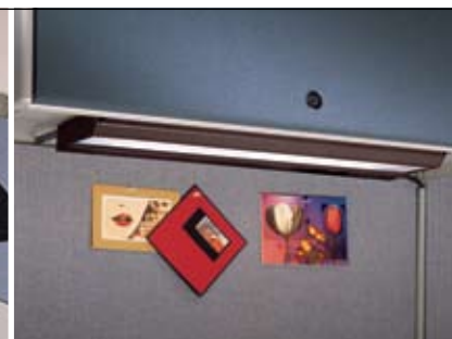
Overhead tasklighting (Light is available in black only.)