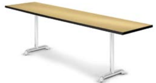
Parley® table Brilliance T-Legs