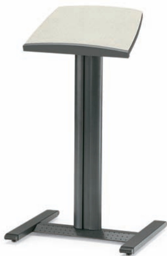
PRESENTATION ENVIRONMENTS Lecterns PSL