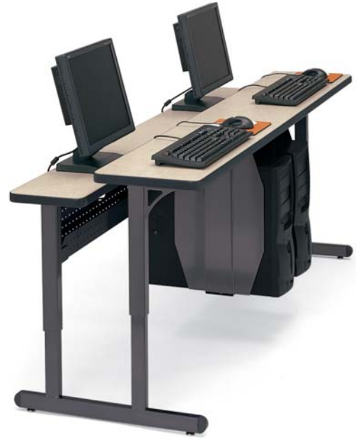
Shown in premium finish options

All Connections series tables are made at one of Bretford's Chicago area manufacturing facilities using union labor.