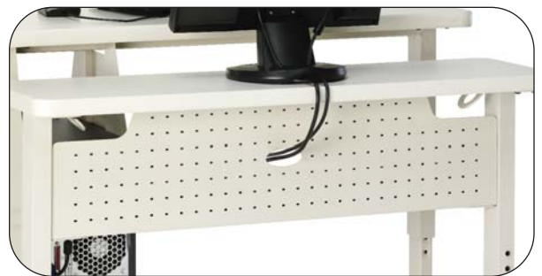
Easy cord management keeps things neat.