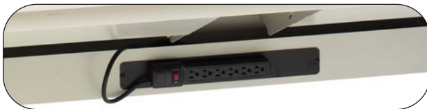
ECF6 Power Strip

ECF6 6-Outlet Power Strip (1 each table)