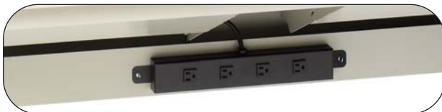
Juice Power System