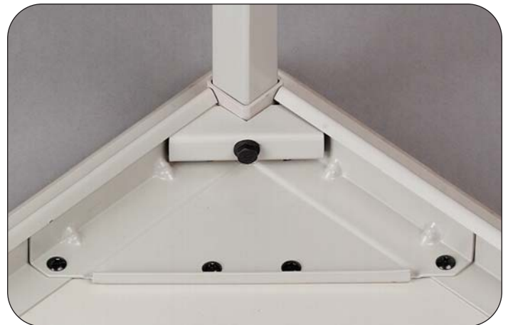
Reinforced Leg Design

All Quattro series tables are made at one of Bretford's Chicago area manufacturing facilities using union labor.