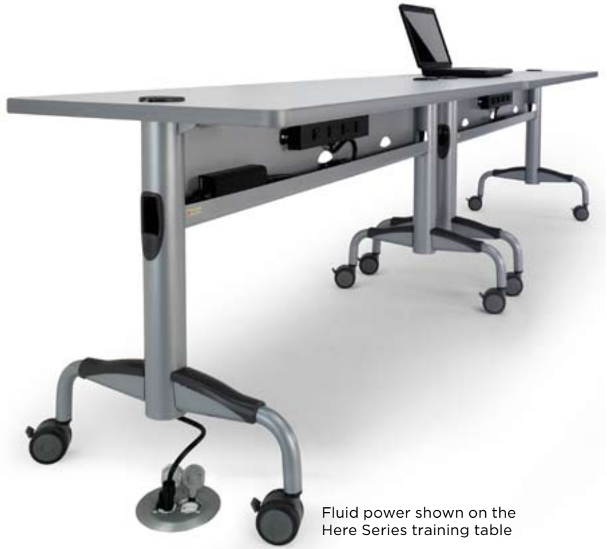
Fluid power shown on the Here Series training table