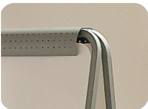
Adjustable pegs easily hold most flip chart pads.