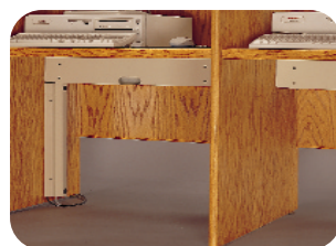
Leg chase brings power and data from the floor to the wire raceway.