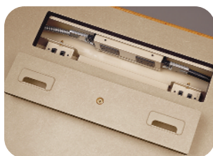
Power access door provides top down access to wire raceway.

Back panels are constructed of 1" (2½cm) thick, 45lb. density industrial grade particle board on both sides with A/A plain sliced and book matched wood finish and a solid 3/8" (1cm) thick, hardwood edge treatment.