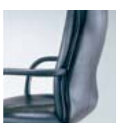
Leather Grade 1 and vinyl All vinyl Communicates a sophisticated, upscale look and feel.