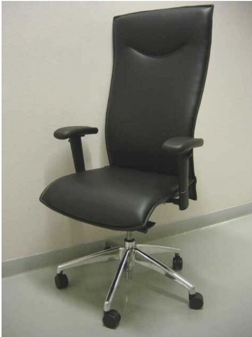
Hugo Office Chair