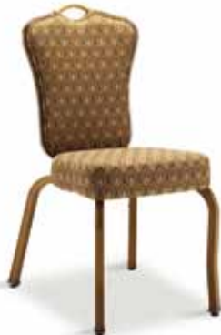
8159 (shown with Handle)