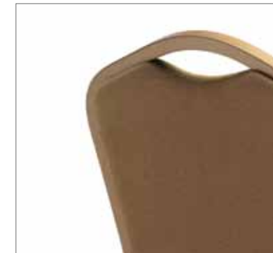
Concealed Back Fasteners