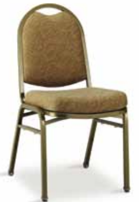
5231 - P