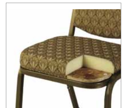
2.3 lb Density Contoured, Molded Seat Foam (Premier and Elite Only)