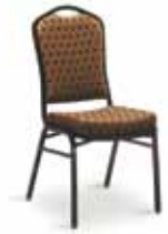
5142 - EAB