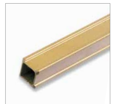
1" Renaissance Square Tubular Aluminum Legs