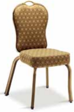
8129 (shown with Handle)