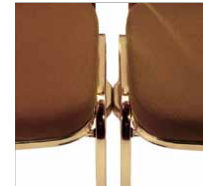
Optional Linking Device