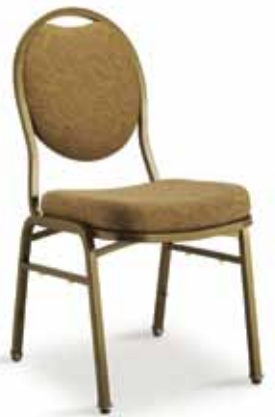
5357 - P