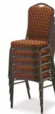
Stacks up to 10 high