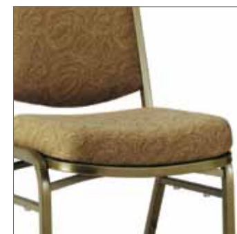
Molded Foam Seat