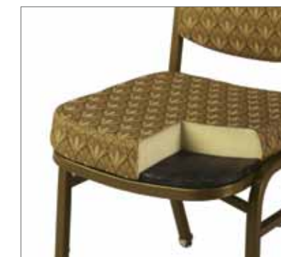
2.8 lb Density Flat-Cut Seat Foam (Classic Only)