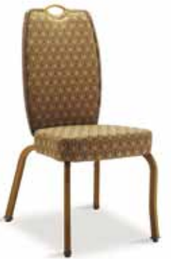
8199 (shown with Handle)