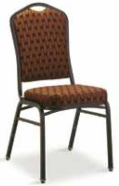
5142 - C