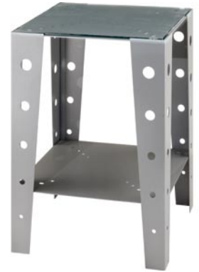
Steel & Glass Top