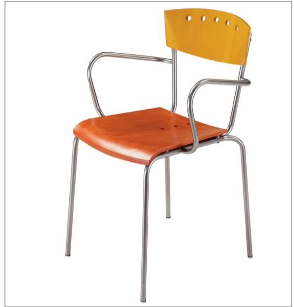
Bikini Wood with contrasting stain on back and seat