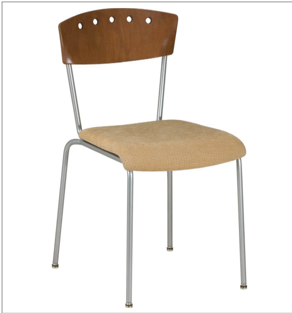
Bikini Wood with upholstered seat