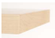
Soft Flat Edge