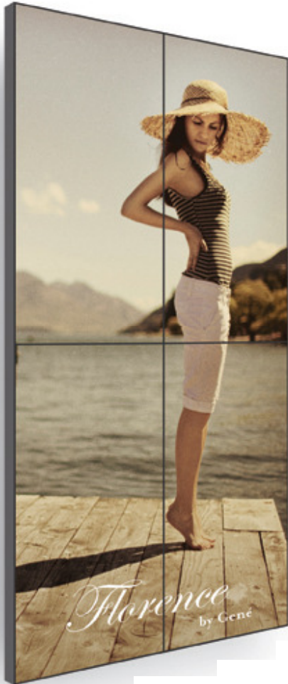
2x2 portrait Clarity Matrix wall