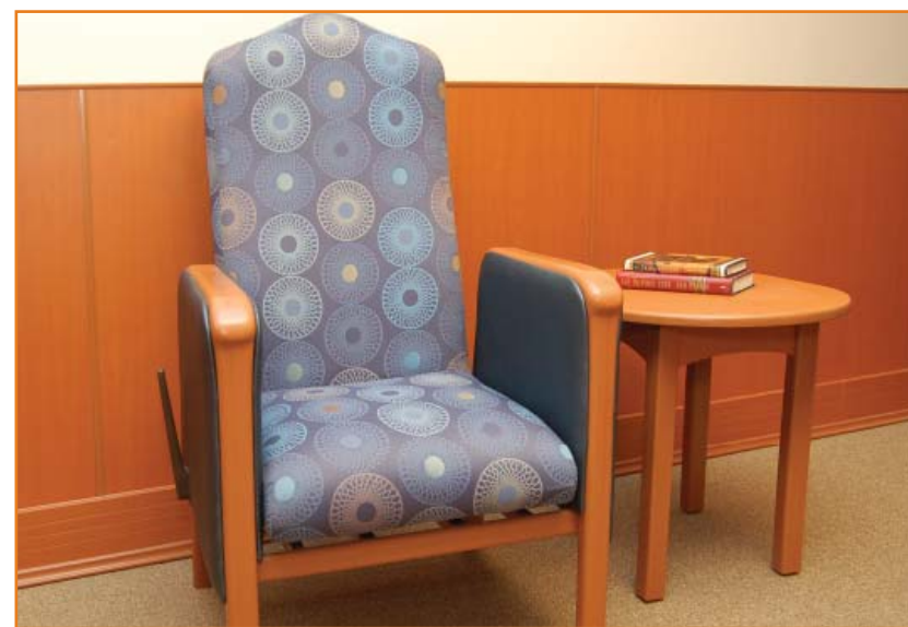
Kwalu Rigid Wall Covering with 4" base rail and base shoe shown with Kwalu Momentum chair and Edward end table

Kwalu rigid wall covering is the perfect solution for several challenging wall protection applications including moist/wet areas, (such as bathrooms), or those in which the additional thickness of the wainscot paneling components is not desirable. Our rigid wall covering can be adapted to almost any application and is well suited for tight budgets. Some products available in Kwik-Ship.