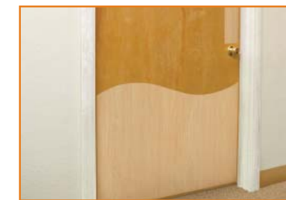
Push Plates and Kick Plates

Doors are perhaps the most vulnerable part of any facility. Kwalu kick plates and push plates are designed to prevent doorway damage while providing aesthetic appeal.