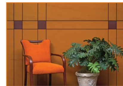
Custom Wall Paneling shown with Kwalu Symphony chair

Kwalu Wall Paneling offers the freedom to create unique designs to suit your space. Combine Virtually Indestructible™ wood grained colors with custom styles for memorable contemporary layouts.