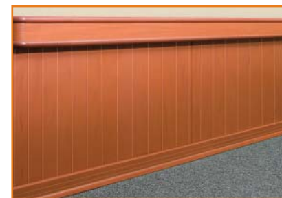
Beaded panels also available (shown with Kwalu Transitional Handrail and 4" base rail and base shoe)

Kwalu rigid wall covering is the perfect solution for several challenging wall protection applications including moist/wet areas, (such as bathrooms), or those in which the additional thickness of the wainscot paneling components is not desirable. Our rigid wall covering can be adapted to almost any application and is well suited for tight budgets. Some products available in Kwik-Ship.