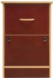
New! Albany – Alzheimer's