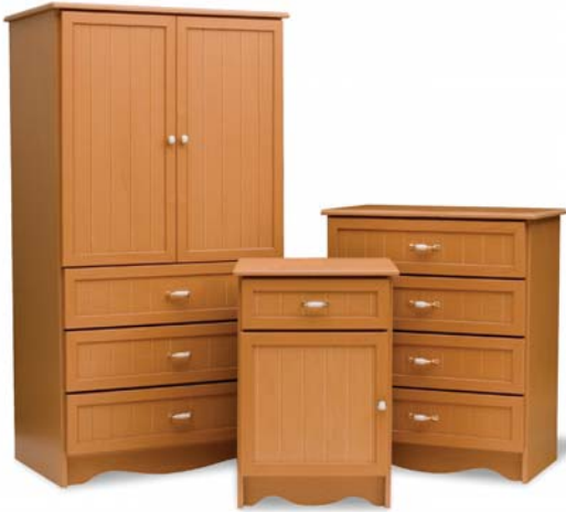
Full casegood ranges available ( Cotswold shown )