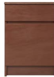
Phoenix – Hard Use

Only Kwalu can ensure a coordinated look throughout your facility with Kwalu Virtually Indestructible™ products: