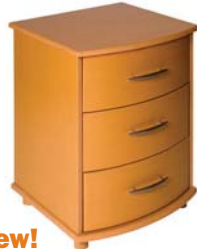
New! Camelot – Curved Front