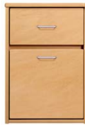
Raleigh – College/Gov't