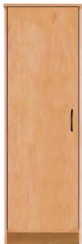
ATWR01L Single Wardrobe