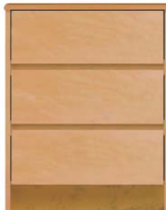
ATCH30 Chest, 3 Drawer