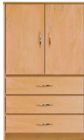
ATAM32 Armoire with 270° Hinged Doors