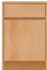
ATBS11R Bedside Cabinet 1 Drawer, 1 Door