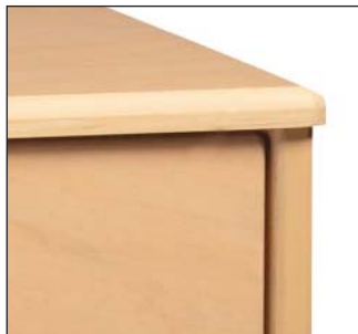
Waterfall edge on tops and inset doors and drawers