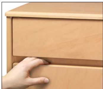
Integrated full-length finger pull shown