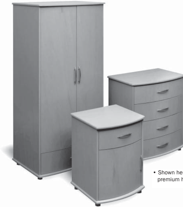
• Shown here with premium hardware

Our Camelot collection combines the romance of a bygone era with a contemporary twist. It features fluid lines and sensuously curved, inset drawer fronts and doors. Round Kwalu feet complete the modern edge to a classic design. Gently rounded edges on all corners and waterfall detailing on all tops make these products ideal for healthcare. The high-impact resistant polymer finish ensures that Camelot casegoods are hard-wearing. The scuff-resistant surface can be repaired within