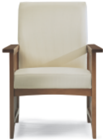
280-51, Patient Highback