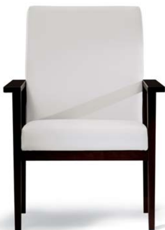
286-51, Patient Highback