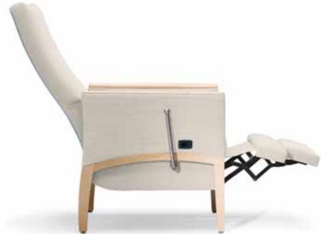
Shown with optional Wood Arm Cap