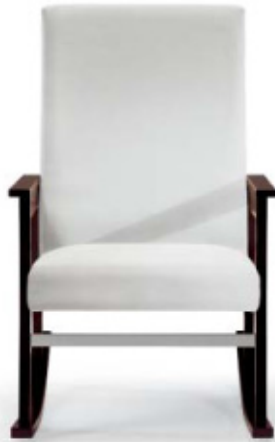
288-60, Rocking Chair