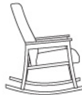
288-60, Rocking Chair