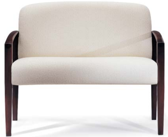
2700-OB40, Bariatric Chair