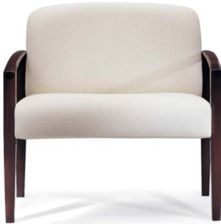
2700-OB30, Bariatric Chair