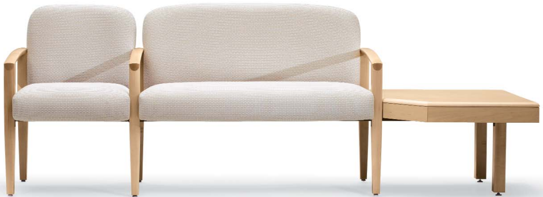
2700-OB2, Bariatric Chair, spanner table and 2700S-10