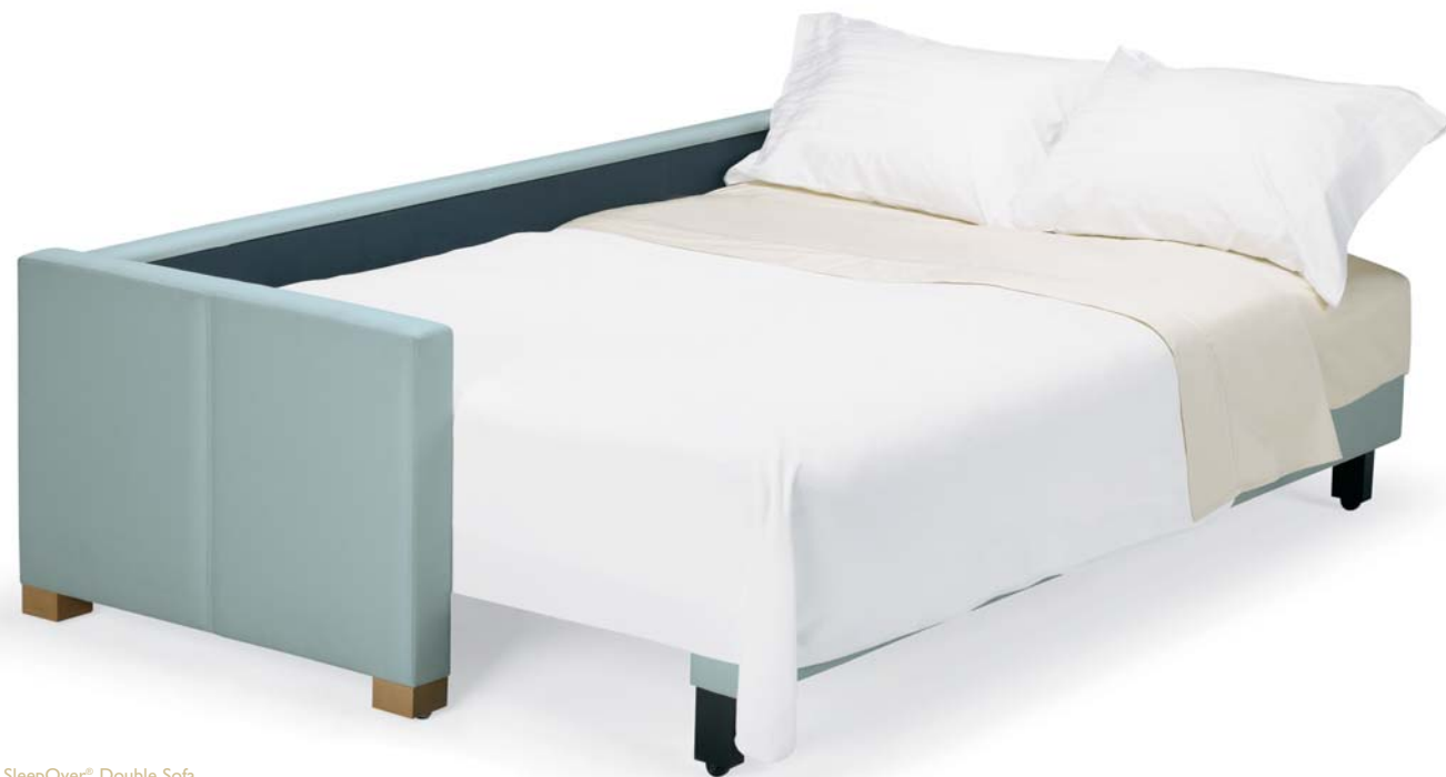
814-37, SleepOver® Double Sofa W=88", D=35½", H=32½" SH=18¼", AH=25" Shown in open sleep position Sleep Surface 54"x80"

This innovative concept functions as both a stylish sofa and a comfortable full size bed. Features include a 54"x80" sleep surface providing maximum space and comfort. Two storage compartments provide ample space for bedding and additional items. Leonard II is the largest sleep surface in a convertible SleepOver®, product on the market.