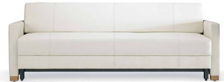
814-37, Sofa W=88", D=35½", H=32½" SH=18¼", AH=25"