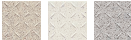
A233CTS Sand Bisque A291CTS Pepper Quartz A900CTS Mica