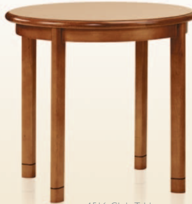
4516 Club Table