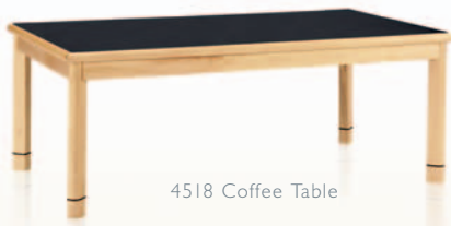
4518 Coffee Table