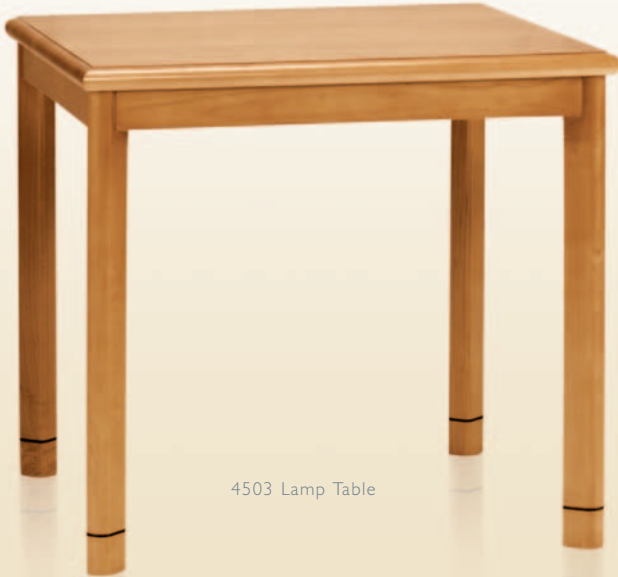
4503 Lamp Table