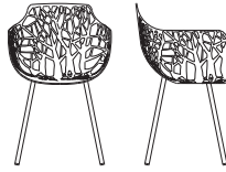
F O R E S T A R M C H A I R

W 21 3 / 4 "(55cm) . D 21 1 / 4 "(54cm) . H 32"(81cm) . SH 17 1 / 4 "(44cm) . AH 26 1 / 2 "(67cm)