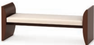
Eno II Bench backless

B01 55" x 20" x 18" h B02 72" x 20" x 18"