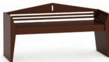
Eno I Bench