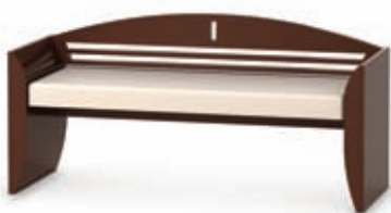
Eno II Bench

B16 55" x 20" x 18" h B17 72" x 20" x 18"