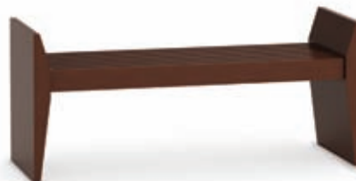
Eno I Bench backless

B03 55" x 20" x 18" h B04 72" x 20" x 18"