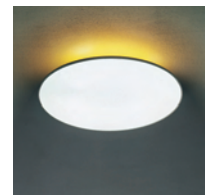
topaz color filter