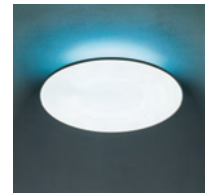
blue color filter