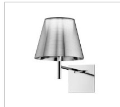
Ktribe W design by Philippe Starck

Wall mounted fixture providing diffused lighting.