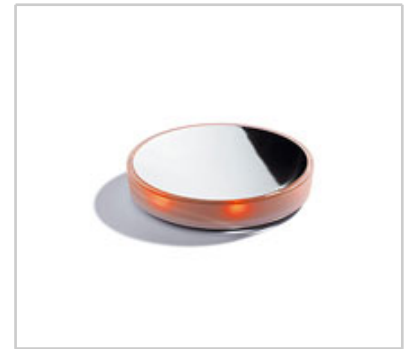
Good night design by Laurene Leon Boym

Floor lamp providing soft light - close to the floor