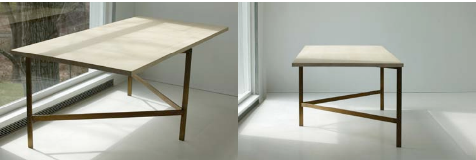
Plank Table CB-331 below shown with Ash top