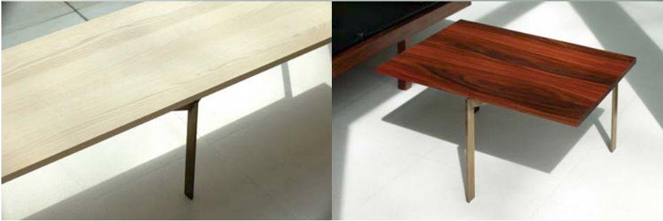
Plank Coffee Table CB-332 above with Ash top and Plank Side Table CB-333 shown with Santos Rosewood top.

Custom sizes available. The plank table series is suitable for both residential or contract use