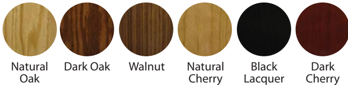
Natural Oak Dark Oak Walnut Natural Cherry Black Lacquer Dark Cherry