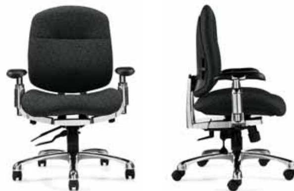
2711 Medium Back Synchro Tilter

The human body was designed to move, it was not intended to sit in a static position facing a computer screen. Movement contributes to good blood flow, properly lubricated joints, feeding spinal disks and ultimately makes us comfortable, alert, healthier and more productive in our activities. Shadow's True Response™ Support System was designed to encourage movement and to automatically adjust to your body's seated position, personal preferences and body scale. Specially designed cushions complete the equation, eliminating pressure points that can restrict blood flow and provide even weight distribution over the entire surface of the chair seat and back.