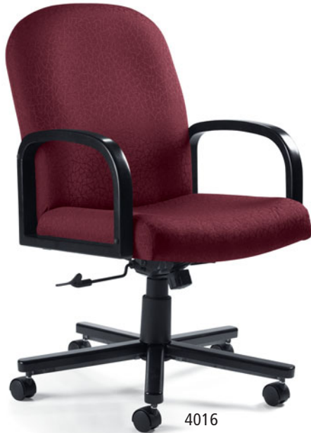
4016 With Available Black Wood Frame