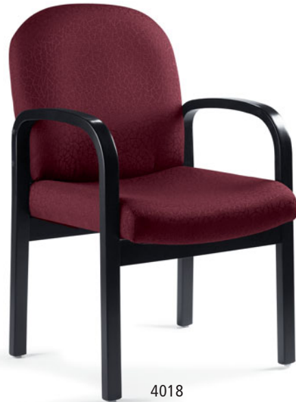
4018 With Available Black Wood Frame

Bring the timeless style of Selectra into your management offices and reception areas. Selectra's sloping arm detail and rich wood frame lend an understated elegance to any office setting. Plush, deep-seated cushions and a comfortable mid back height provide a pleasant seating experience. Single position tilt lock is standard on model 4016.