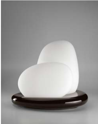
White with Brown Base