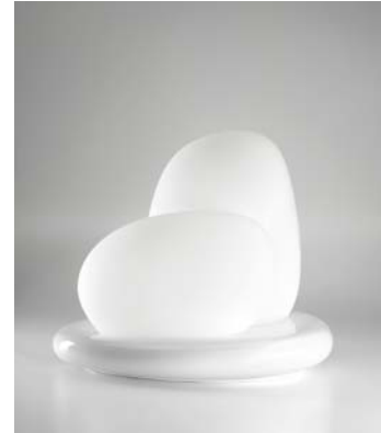
White with White Base