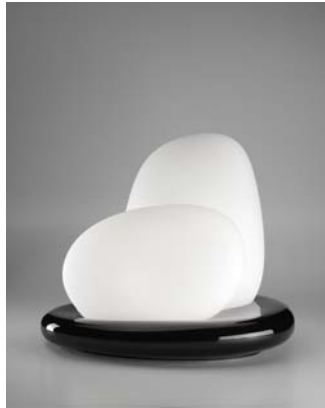
White with Black Base