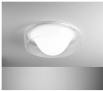
CRYSTAL WITH MILKY WHITE CENTER