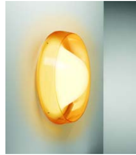
AMBER WITH MILKY WHITE CENTER