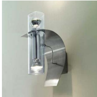
transparent light blue