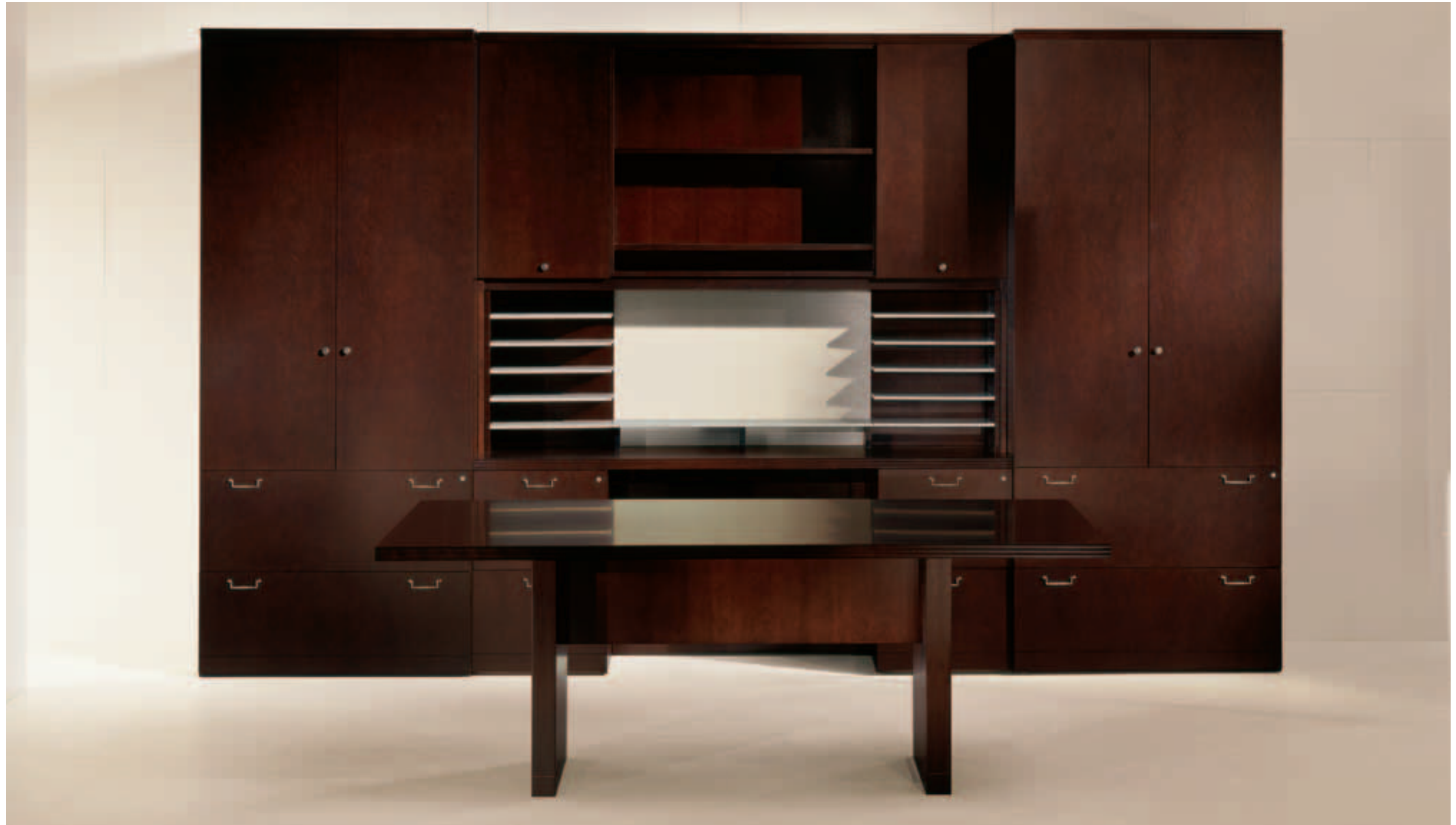
04 | The Fairmont table desk is a simple yet elegant form. Crown molding is optional on all overhead, credenza tower and vertical storage units.