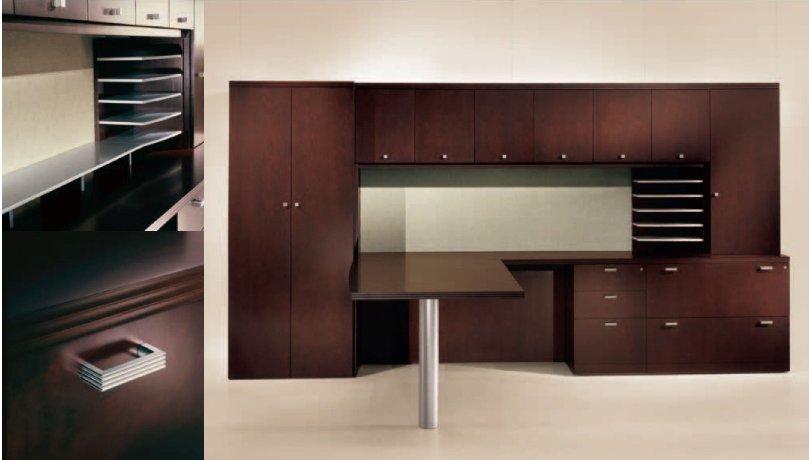
01 Fairmont offers paper management towers in satin silver or black powder coat finishes. The fluted Gaston pull is standard in the satin nickel finish.