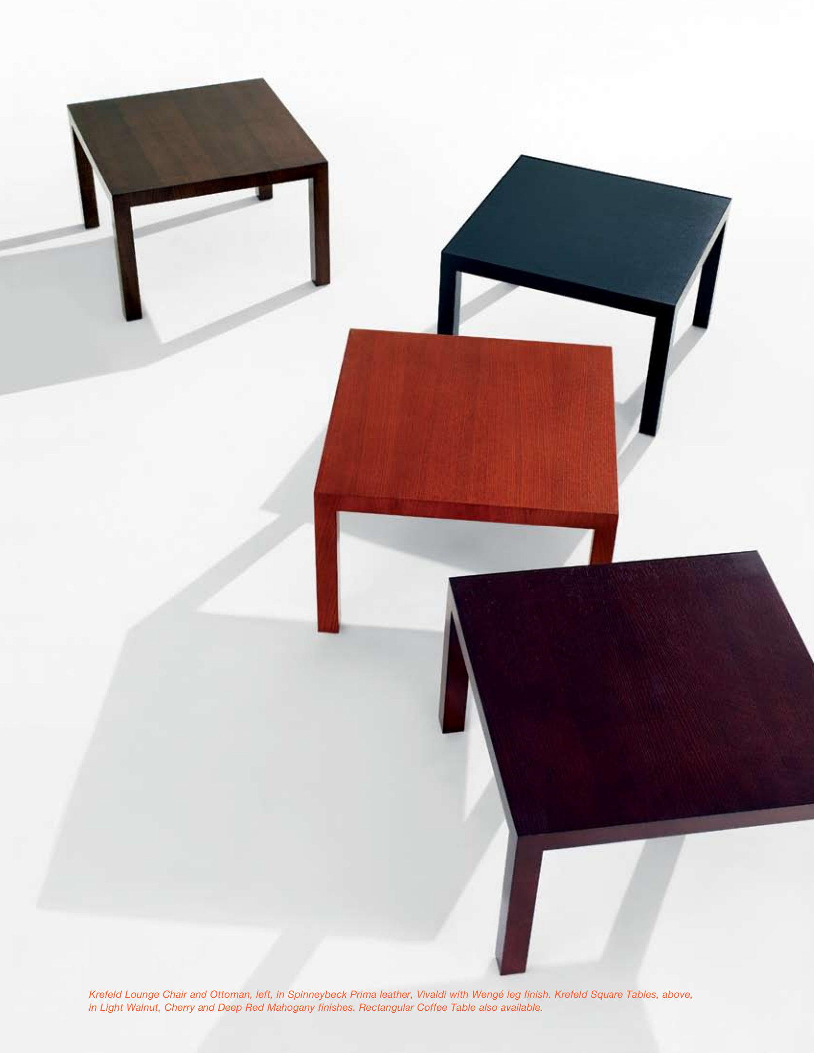
Krefeld Lounge Chair and Ottoman, left, in Spinneybeck Prima leather, Vivaldi with Wengé leg finish. Krefeld Square Tables, above, in Light Walnut, Cherry and Deep Red Mahogany finishes. Rectangular Coffee Table also available.