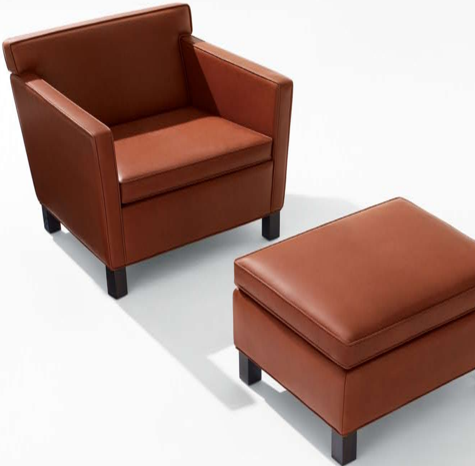
Krefeld Lounge Chair, Ottoman and Tables