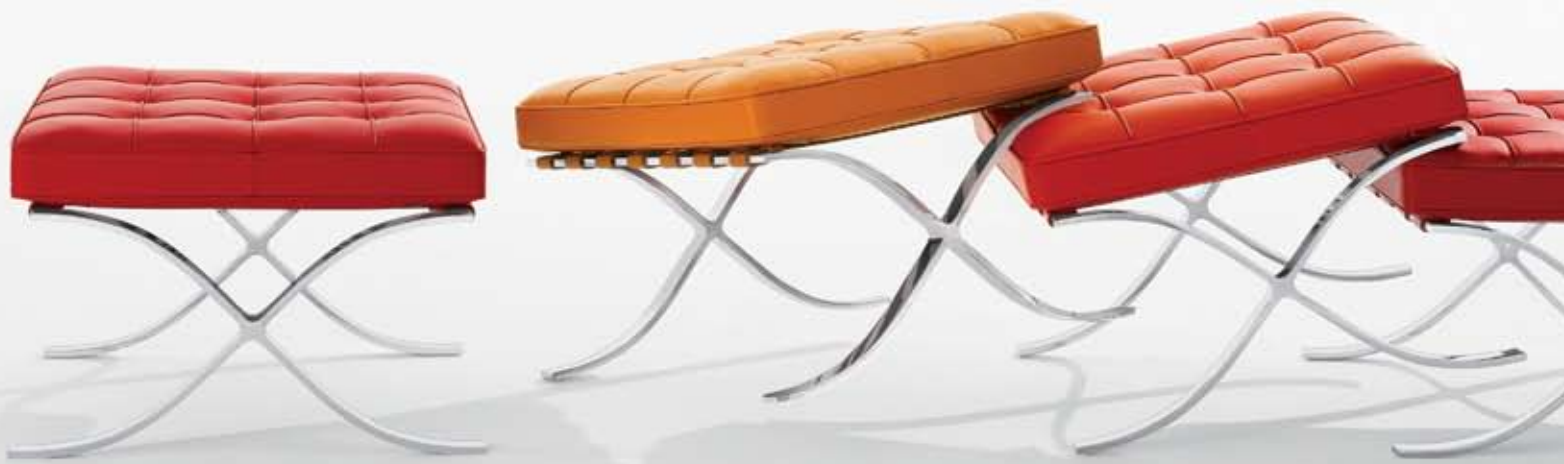
Barcelona Table, left, and Barcelona Stools, above, available in stainless steel and chrome. Stools in Spinneybeck Sabrina leather, Carmen; Amazon, Laranja; Riva, Beccorosso; and Sabrina, Rhubarb.