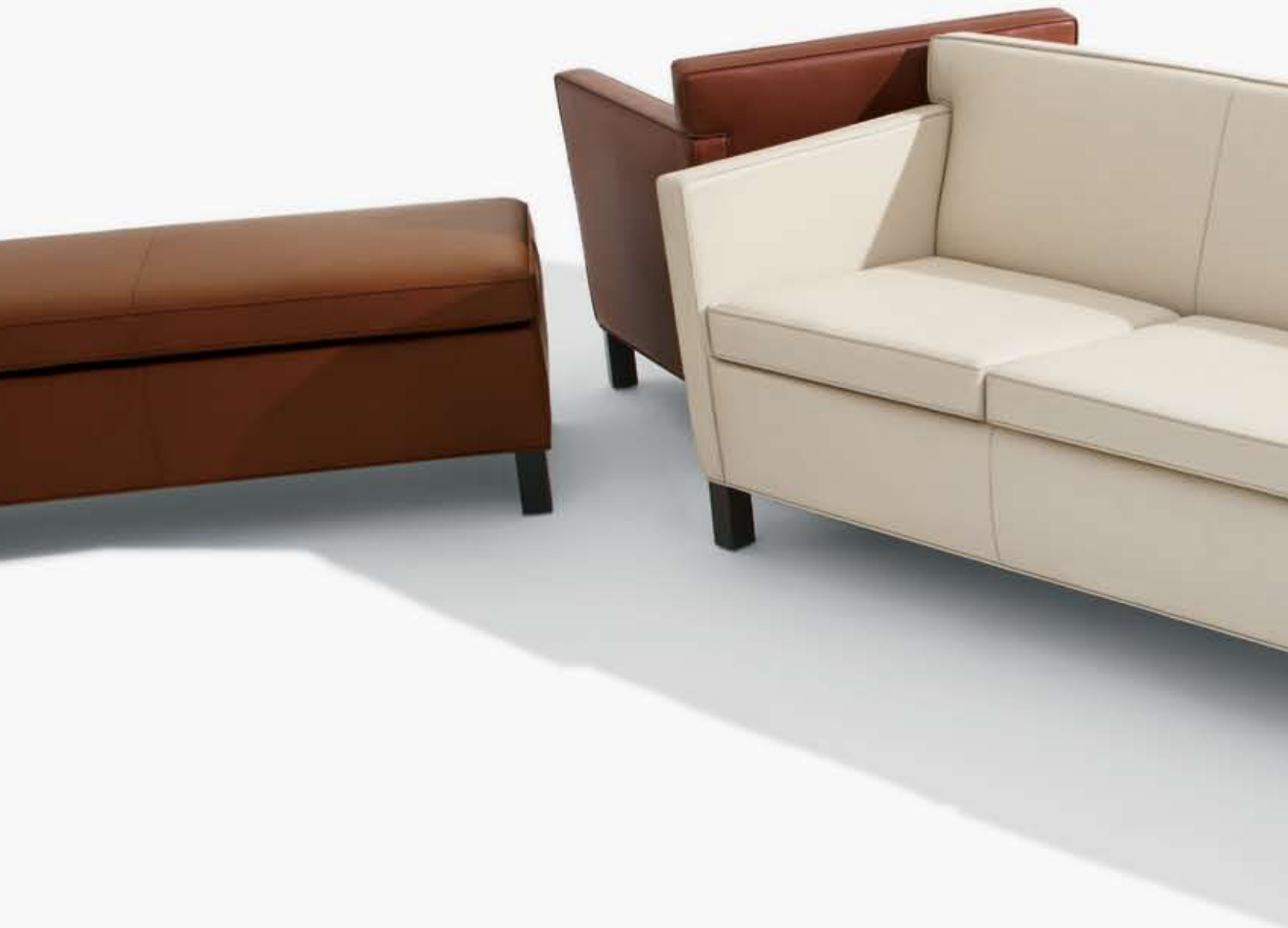
Krefeld Large Bench in Spinneybeck Espana leather, Toledo; Lounge Chair in Prima, Vivaldi; Sofa in Espana, Toledo; and Settee in Prima, Scarlati with Wengé leg finish.