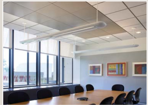
2' x 2' Filaments Network Frost with 2' x 2' MetalWorks Vector Extra Microperf panels in Gun Metal Grey, SoundSoak Acoustical Wall System Grey Mix, Prelude 15/16" Gun Metal Grey grid.