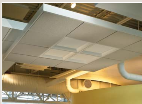
8' x 8' Formations™ Accent Cloud with 2' x 2' Filaments Nitro Tonic and 2' x 2' Metaphors® Convex Coffers with Ultima® Tegular infill panels and Prelude 15/16" White grid.