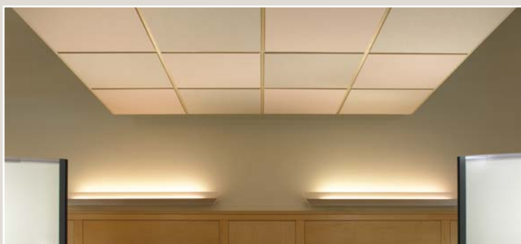
6' x 8' Formations Accent Cloud with 2' x 2' Filaments Anchorage Vanilla and Lido Hermosa, Prelude 15/16" Vanilla grid.