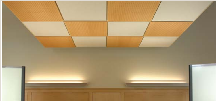
6' x 8' Axiom® Cloud with WoodWorks® Vector 2' x 2' Maple panels and 2' x 2' Filaments Anchorage Vanilla, Prelude 15/16" Vanilla grid.