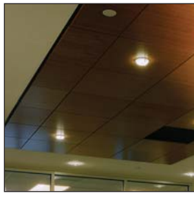
WoodWorks Tegular Perforated

Earning high marks for aesthetics, innovation and sophistication has never been easier. Whether your design calls for standard material or custom millwork, WoodWorks ceilings make the grade for their ability to provide an upscale, warm and welcoming environment in concert halls, museums and other high-profile spaces. Your image is showing!