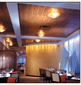
WoodWorks Vector Perforated

Renewable. Exotic. Relish in the natural elegance of bamboo-WoodWorks Vector is a standard ceiling that offers a sophisticated, monolithic look with the convenience of downward accessibility. A patron of many spaces, it can be found in lobbies, offices, corridors, retail, hospitality and transportation. An optional on: fiberglass infill with perforated panels will help to keep the noise down when the ovations begin.