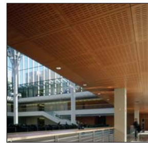
WoodWorks Access Custom Perforated Ceilings

On the cover: WoodWorks Access Custom Curved Ceilings with Custom Upturns University of Tennessee, Neyland Stadium Knoxville, TN