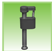
P030176 Pilot operated fill valve