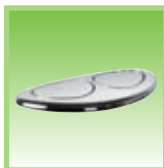
P030328 Dual action push button Available in Polished Chrome finish only.