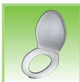
8085 Round "Lift 'N' Clean" toilet seat. Seat can be removed quickly for ease of cleaning.