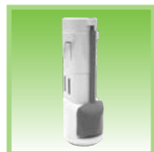
P030370 Dual, flapperless flush valve