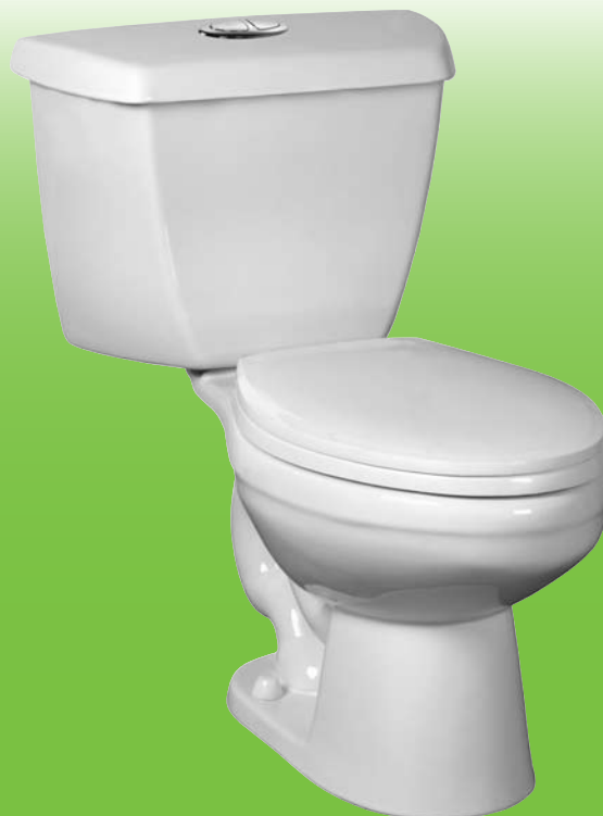
Shown with 8085 "Lift 'N' Clean" Toilet Seat