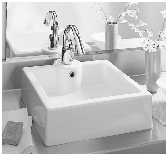
Shown with Iperbole faucet (5131.101.002)