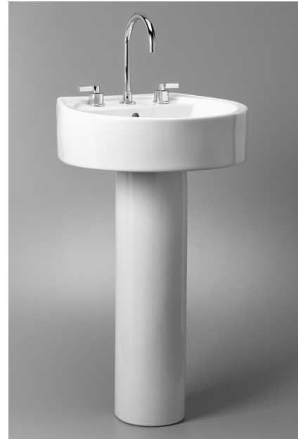
Shown with Chipperfield widespread faucet (5120.801)