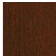
T422 (3422) Medium Cherry on Cherry