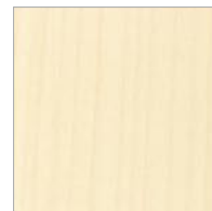
T582 (3582) Winter on Maple