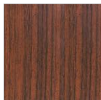
T712 (3712) Natural Walnut on Walnut