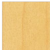
T572 (3572) Amber on Maple