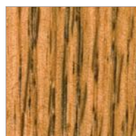
T102 Red Oak - Medium Stain