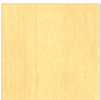
T592 (3592) Blonde on Maple