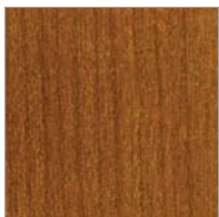
T412 (3412) Natural Cherry on Cherry