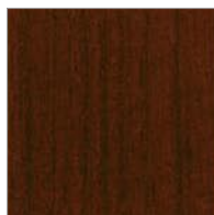
T772 (3772) Medium Mahogany on Walnut