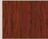
HERITAGE CHERRY ON WALNUT FINISH HC