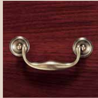
ANTIQUE BRASS PULL