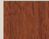
IMPERIAL WALNUT FINISH IW