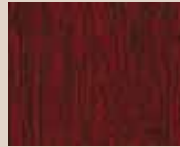
ROYAL MAHOGANY FINISH RM