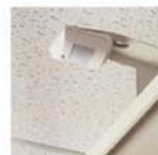
Human presence detection system

CAR DEALERS PHARMACIES MEDICAL AND DENTAL CLINICS OFFICES CORRECTIONAL FACILITIES HOSPITALS RETAIL ETC.