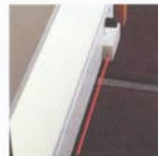
Toe-level infrared beam